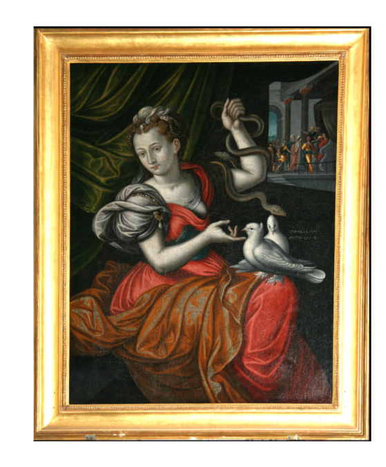
Prudence Saint Thomas d'Aquin