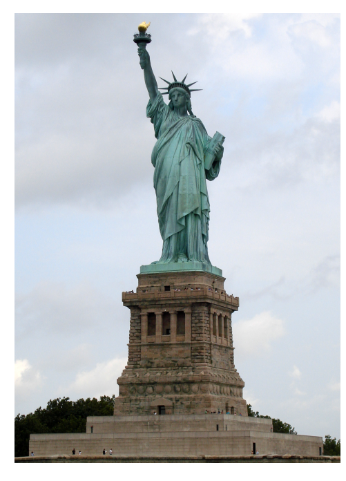
Statue of Liberty Auguste Bartholdi